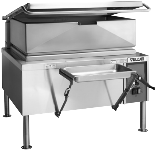
VE40 FastBatch™ Electric Braising Pan with Optional Motorized Lift