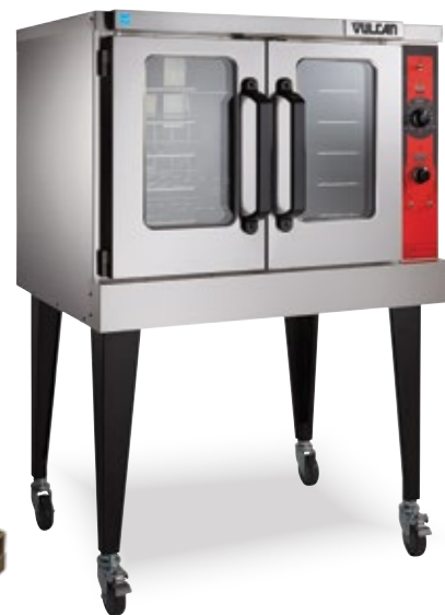
Model VC5G Shown with optional casters