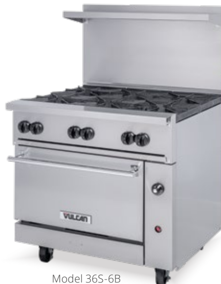
Model 36S-6B Shown with optional casters