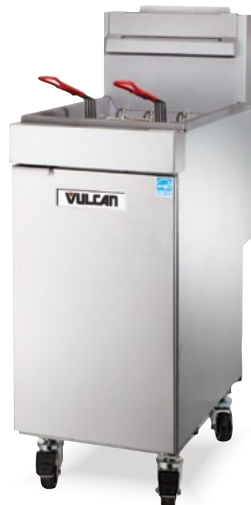
Model 1VEG35M Shown with accessory casters