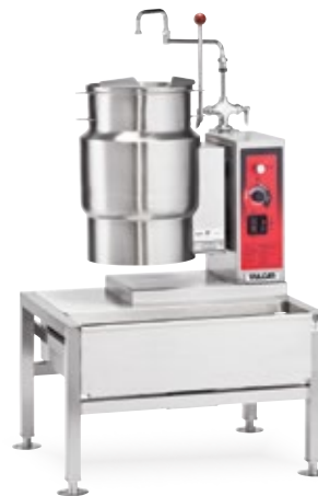
Model K6ETT Shown with optional stand and faucet