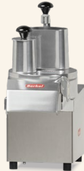
Model M2000 Additional Models Available