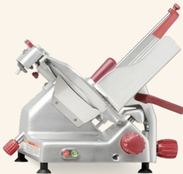
Model 827A-PLUS Additional Models Available