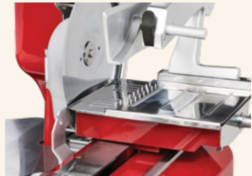
Model 330M - Carriage Tray detail