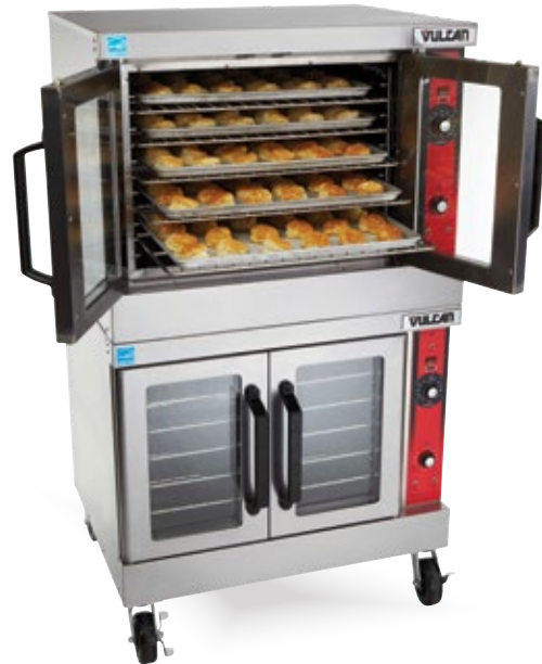
Model VC44GD Shown with optional casters