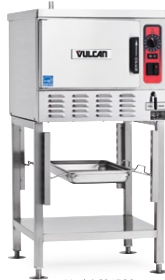
Model C24EO3 Shown with optional stand