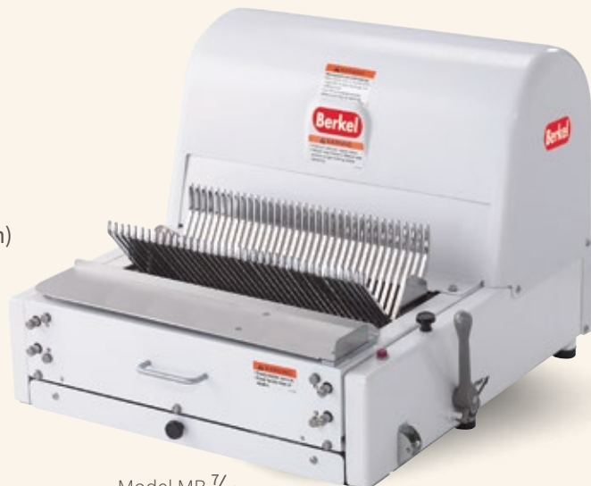
Model MB 7 / 16