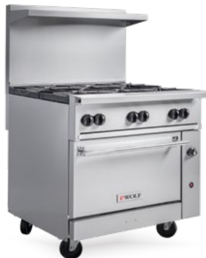
Model C36S-6BN Shown with optional casters