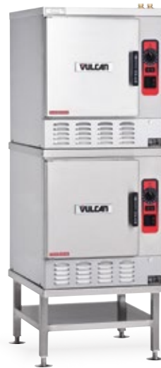
Two C24EA5 PS Steamers Shown with STCKKIT 24EA and STAND 15YSG