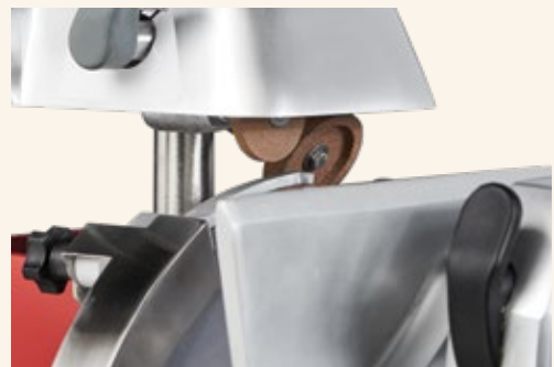
Model 330M - Sharpener detail