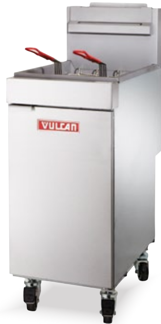
Model LG300 Shown with accessory casters