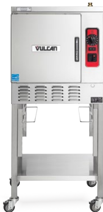
Model C24EA5-LWE Shown with optional stand