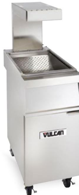
Model VX15 Shown with optional ThermoGlo™ Food Warmer