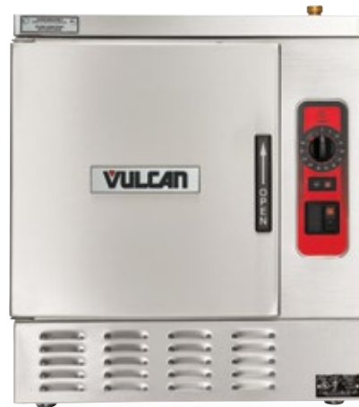
Model C24EA5 PLUS