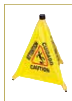
Set includes pop-up "Caution" cone