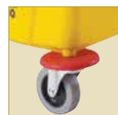
Non-marking casters with bumpers