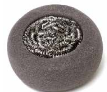
434-FOAM-18PK Foam Ring Stainless

Premium Series Stainless Steel Wideband construction. The strongest and longest-lasting stainless steel scrubber available. Will not rust or splinter.