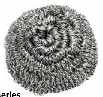
400 Series Stainless Steel

Commercial Series Stainless Steel Strong and long-lasting stainless steel scrubber. Will not rust or splinter. Com-