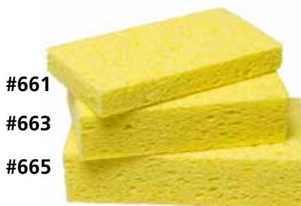
#661 #663 #665 Cellulose Sponge Blocks