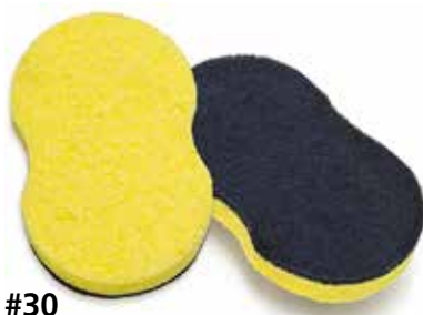
#30 Cool Blue Scrubber Sponge