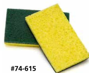
#74-615 Green Polyurethane Sponge