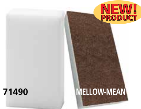
71490 MELLOW-MEAN Eraser Sponges

The melamine block sponge works on stains and marks on all types of surfaces. This sponge is most effective on smooth, hard surfaces with only water required. Hand-size melamine cleaning surface on all sides.