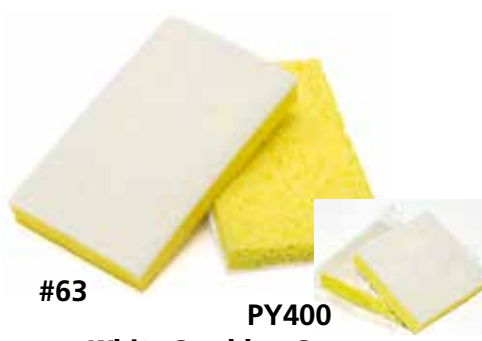
#63 PY400 White Scrubber Sponge