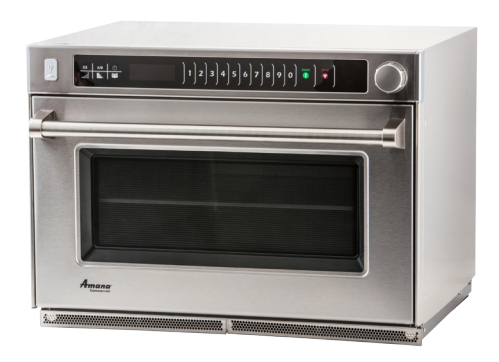
Model AMSO22 shown