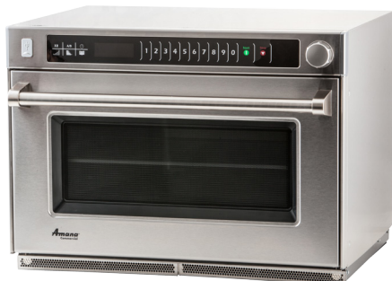
Model AMSO35 shown