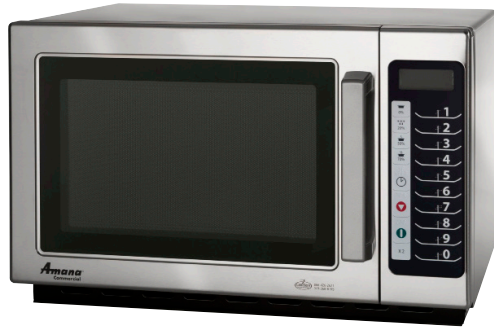
Model RCS10TS shown