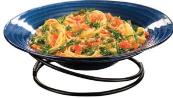
LWUS1041 shown with GBB20 bowl