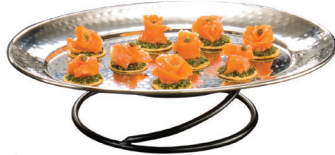
LWUS738 shown with HMRST1801 tray