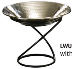
LWUS899 shown with HMRD12 bowl