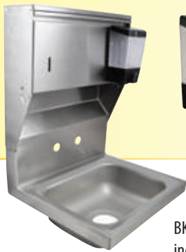
BKHS-W-1410-4D-TD includes Towel & Soap Dispenser