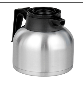
CARAFE,SST 1.9L SHRT BLK 1/