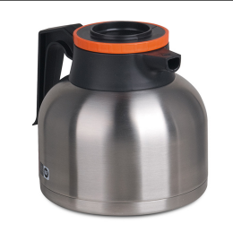
CARAFE,SST 1.9L SHRT ORN 1/