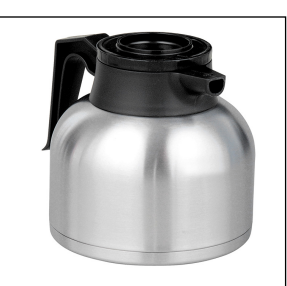
CARAFE,SST 1.9L SHRT BLK 12/