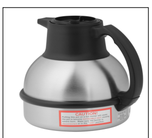
THERMAL CARAFE, BLK 1.9L 12PK