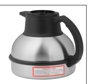
THERMAL CARAFE,ORN 1.9L 12PK