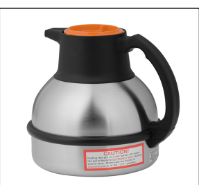
THERMAL CARAFE,ORN 1.9L 1PK