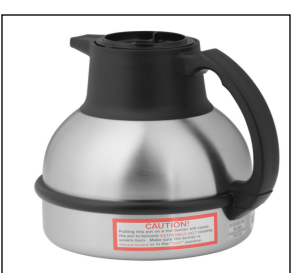
THERMAL CARAFE, BLK 1.9L 1PK