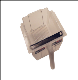
POUCHPACK FUNL AY, TEA SMK S-T