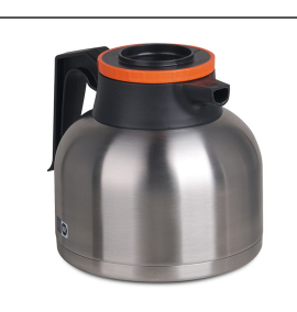
CARAFE,SST 1.9L SHRT ORN 12/