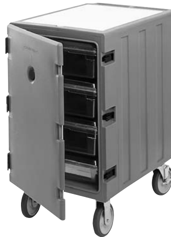
1826LBC (For Food Storage Boxes)