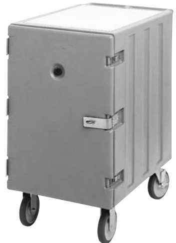
1826LBCSP (With Security Package)