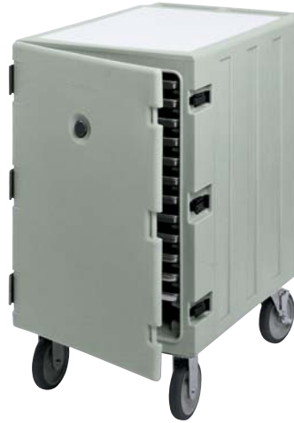
1826LTC (For Trays & Sheet Pans)