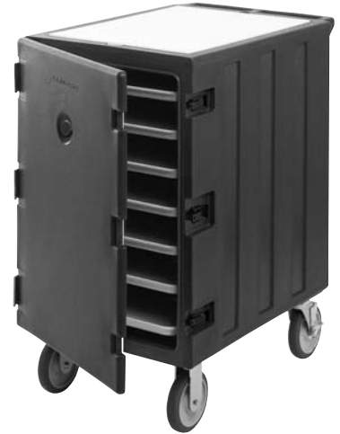
1826LTC3 (For Trays & Sheet Pans)