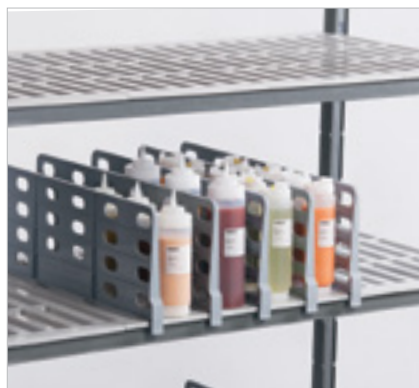
Keep squeeze bottles organized.