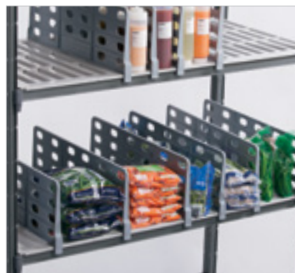
Keep sealed packages neatly stacked.