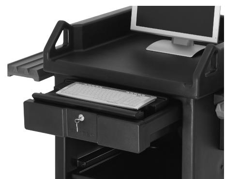
VCS32KEYT Optional Keyboard Tray