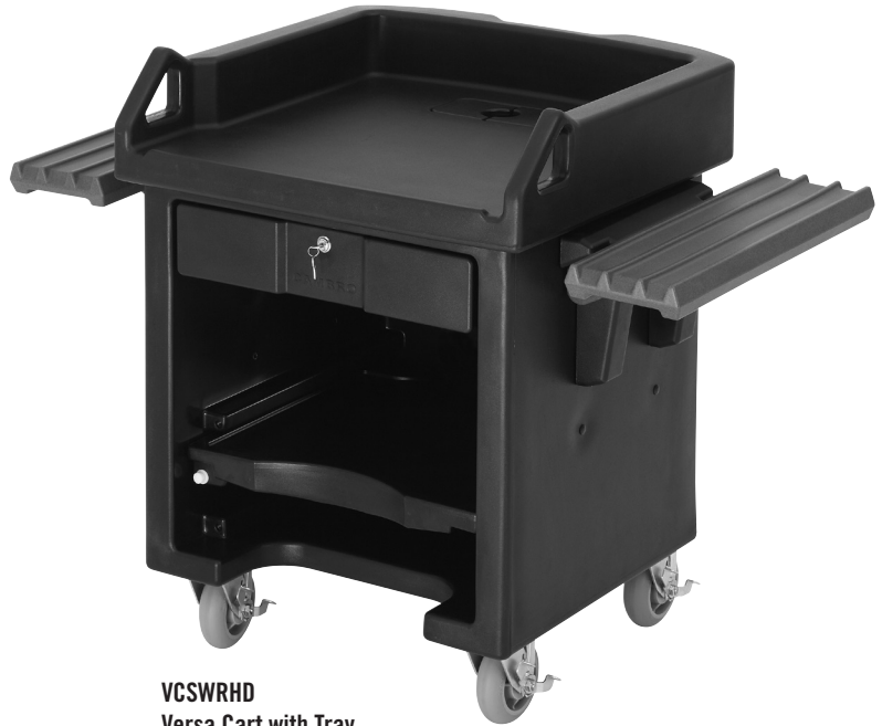
VCSWRHD Versa Cart with Tray Rails shown with optional heavy-duty casters.