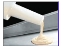
Pour batters and oils

Find replacement parts at www.carlislefsp.com/replacement-parts