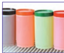
Stackable backup storage