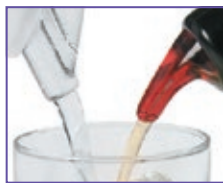
Perfect 2-1 drinks are easy