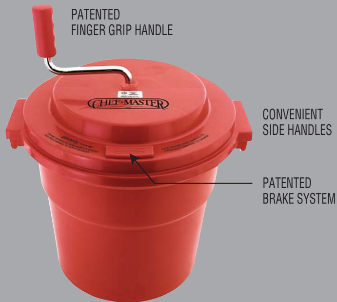
Item No: 90005