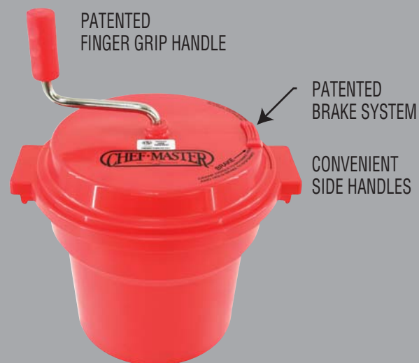
Item No: 90012