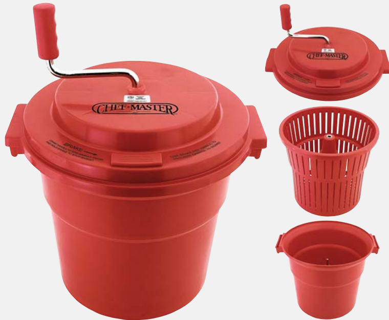
Item No: 90005