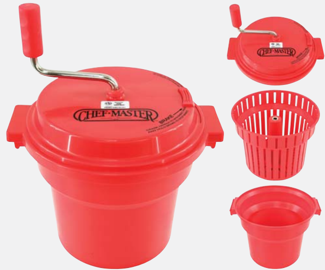
Item No: 90012