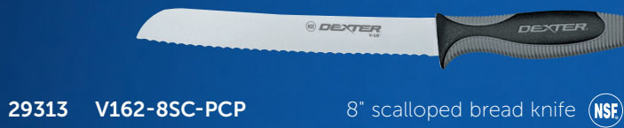
29313 V162-8SC-PCP 8" scalloped bread knife NSF