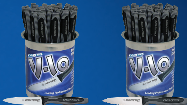
29453 V105-36B 3 1/2" parers, bucket of 36