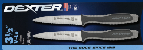
29493 V105SC-2PCP 2 pack 3 1/2" scalloped parers NSF