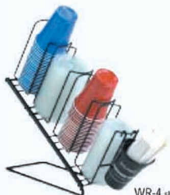
WR-4 shown with WR-STAND & WR-STRAW