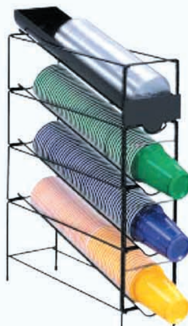
WR-CT-4 shown with WR-CT-LID