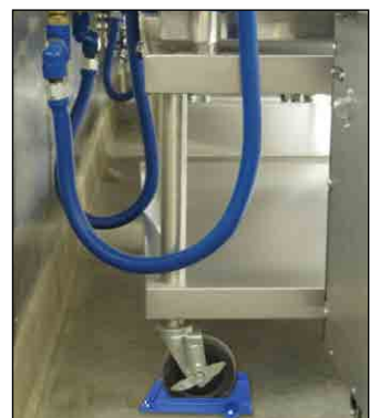
Open floor design allows appliance to sit firmly on the floor to ensure even cooking.

Safety-Set ensures that the appliance is situated beneath the fire suppression or ventilation systems.