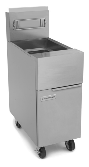
GF40 Shown with casters