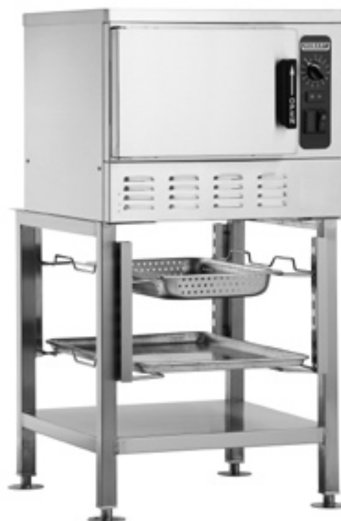
Shown on optional stand with extra set of pan slides and pans