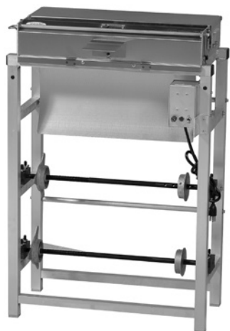
W32-6 Wrap Station

SHIPPING WEIGHTS: W32 – 50 lbs.; W32C – 60 lbs.; 55A – 10 lbs.; 69A – 5 lbs.