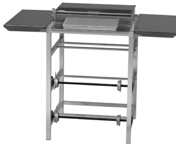
W32C-5 Wrap Station with two optional 69A Platter Shelves