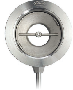
Stainless Steel Ball Valve shown open