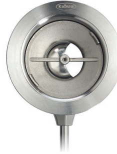
Stainless Steel Ball Valve shown halfway open