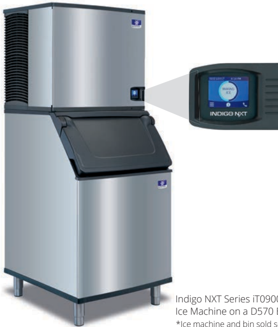
Indigo NXT Series iT0900 Ice Machine on a D570 Bin *Ice machine and bin sold separately

Designed for operators who know that ice is critical to their business, the Indigo®NXT Series ice machine's preventative diagnostics continually monitor itself for reliable ice production. Improvements in cleanability and programmability make your ice machine easy to own and less expensive to operate.