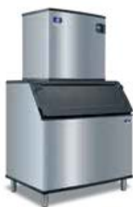
IDF1400C Ice Machine on a D-970 Bin