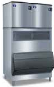
Two IDF1400C Ice Machines on a F-1650 Bin