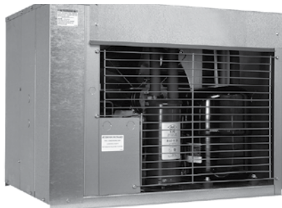
CVDF1400 Condensing Unit