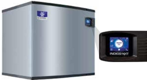
IDF1400C Ice Cube Machine - 115V