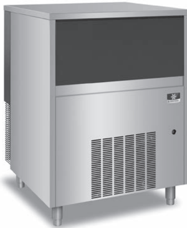
Model UNP0300A Nugget Ice Machine