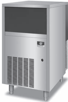
Model UNP0200A Nugget Ice Machine