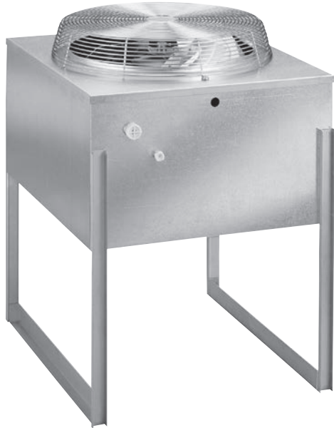
JCF900 Remote Condenser

Models JCF0500 JCF0500Q(Coated Coil) JCF0900 JCF0900Q(Coated Coil)