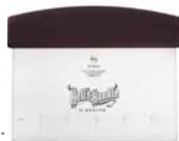
M18370 5⅞" x 3½"