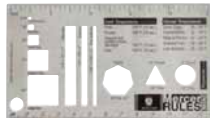
M33243 Mercer Rules Mini™ 5¼" x 3"