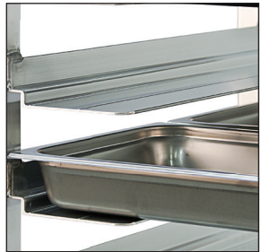
Stepped-Angle Pan Racks #4640- 13 sets of angle runners #4642- 20 sets of angle runners

This information is for general sales and engineering use only. New Age Industrial reserves the right to modify or make changes at any time without notice to materials and specifications.