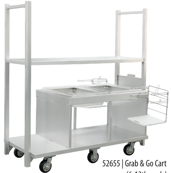
52655 | Grab & Go Cart (6-12th grade)