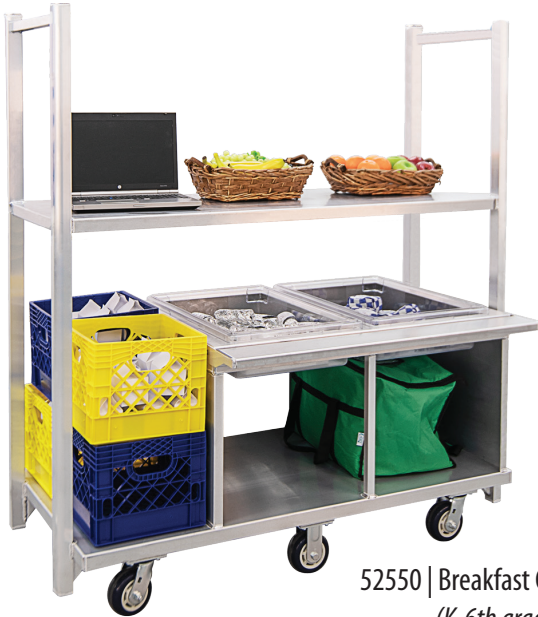
52550 | Breakfast Cart (K-6th grade)