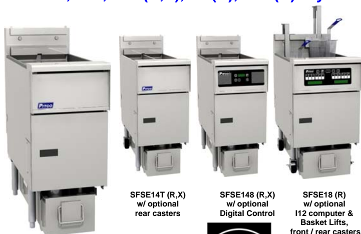
SFSE14 (R,X) w/ standard SSTC