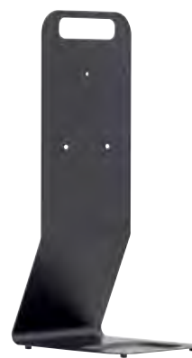
AutoFoam Tabletop Station