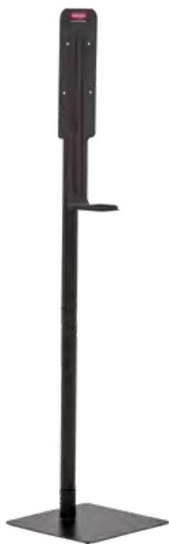
AutoFoam Standard Floor Stand