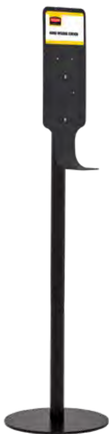
AutoFoam Premium Floor Stand