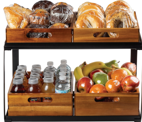
11000 Two-Tiered Riser Frame with: (2 ea) CRATE12 Half Size Crate (2 ea) CRATE124 Half Size Crate