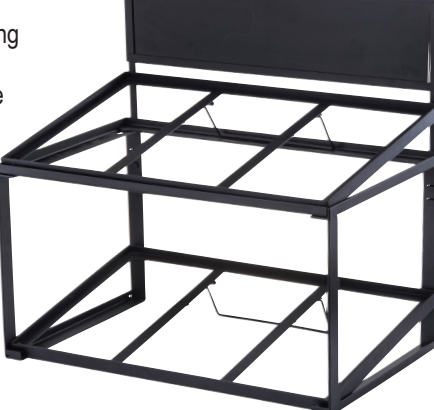
Each tier of this riser display is designed to fit: (1 ea) Full, (2 ea) Half, (3 ea) Third or (4 ea) Fourth Size Wood Crates featured on pages 79