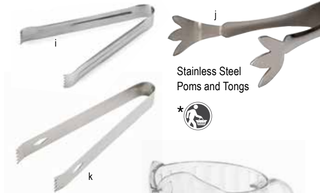
Stainless Steel Poms and Tongs