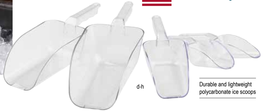
Durable and lightweight polycarbonate ice scoops