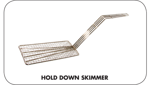
HOLD DOWN SKIMMER