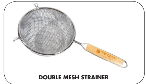
DOUBLE MESH STRAINER