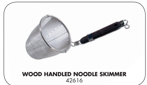
WOOD HANDLED NOODLE SKIMMER 42616