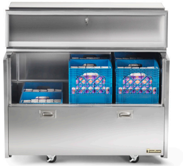
Model Shown - RMC49D4