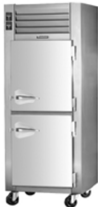
Model RDT132EUT-HHS (shown with optional casters)