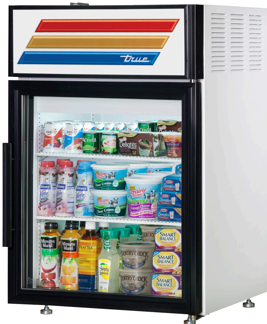
Shown with optional white exterior.

Swing Door Counter-Top Refrigerator with LED Lighting