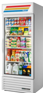
Optional White Exterior