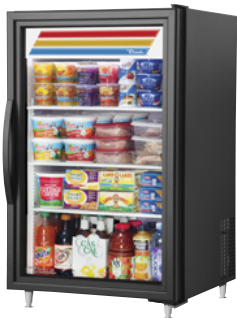
Standard Black Exterior