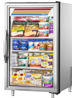
Optional Stainless Exterior