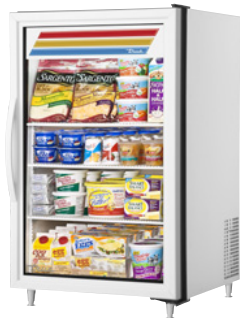
Optional White Exterior