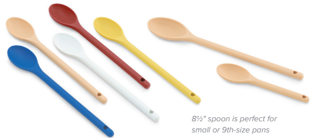
8½" spoon is perfect for small or 9th-size pans