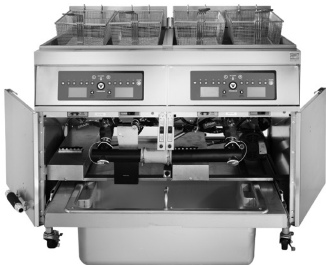
Model 2ER85CF Shown on casters (Accessory)