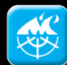
Heavy Duty Cooking