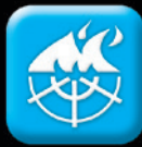
Heavy Duty Cooking