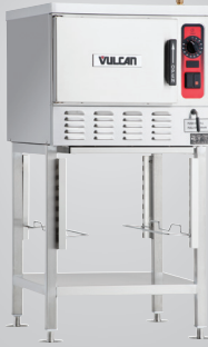
Electric Counter Model