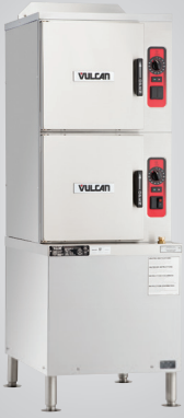
Gas/Electric Convection Floor-Standing Model