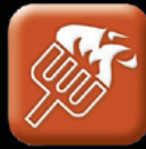
Griddles & Charbroilers