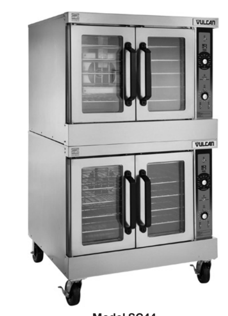
Model SG44 shown with optional casters