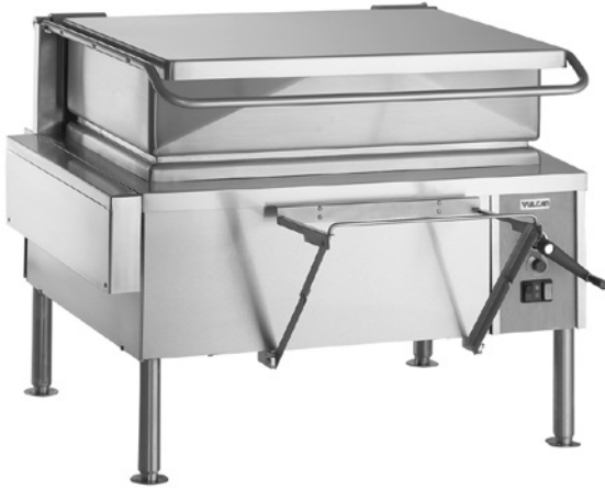
Shown with enclosed faucet bracket