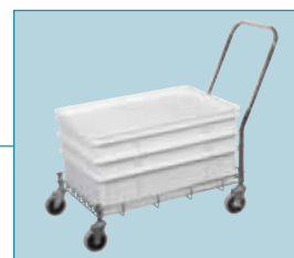
Transport dough boxes