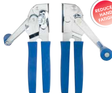
Front gears Back handle