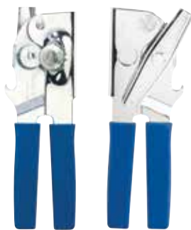
Front gears Back handle