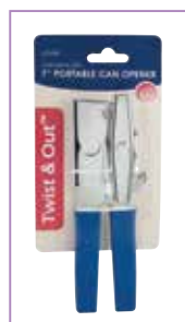
Twist & Out™ hanging packaging