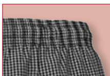
Elastic waistband, inner drawstring