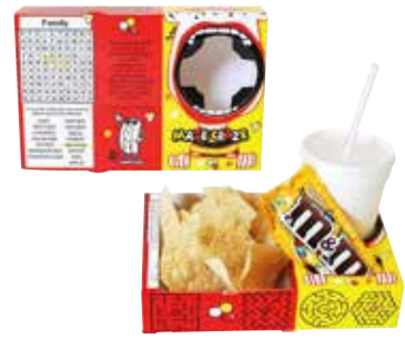
47001 Note: serving tray style may vary from shown