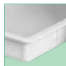
Reinforced edges & corners