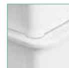
Seamless fit for fresh storage